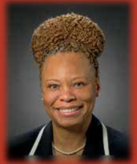
CHIEF EXECUTIVE OFFICER COMMUNITY ACTION AGENCY OF ST. LOUIS COUNTY, INC.