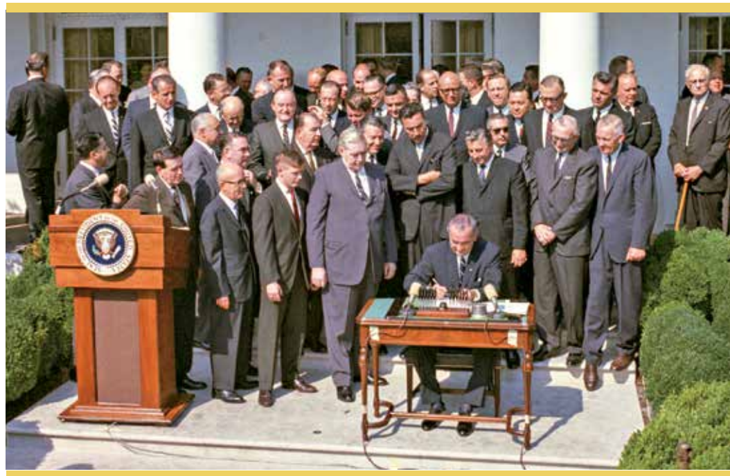
President Lyndon B. Johnson signs the Poverty Bill (also known as the Economic Opportunity Act) in the Rose Garden of the White House, while press and supporters look on. August 20, 1964.

In May of 1964, in a speech to University of Michigan graduates, Johnson declared America had the wealth and the power to build the Great Society: "The Great Society rests on abundance and liberty for all. It demands an end to poverty and racial injustice to which we are totally committed in our time." To achieve the vision of the Great Society, an unprecedented number of bills were enacted—bills addressing civil